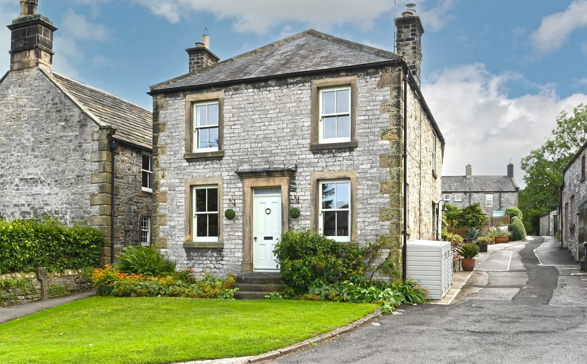
Harrow House, Main Street, Great Longstone, Derbyshire, DE45 1TA